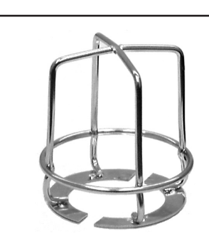
Dry Sprinkler Guard (Order sprinkler guard separately from sprinklers.)