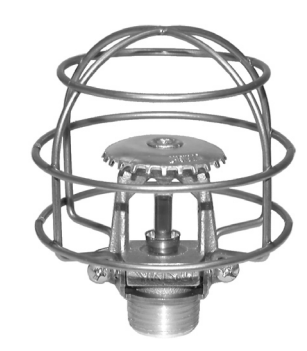
Model D-1 Sprinkler Guard on Upright and Pendent Frame-Style Sprinklers*